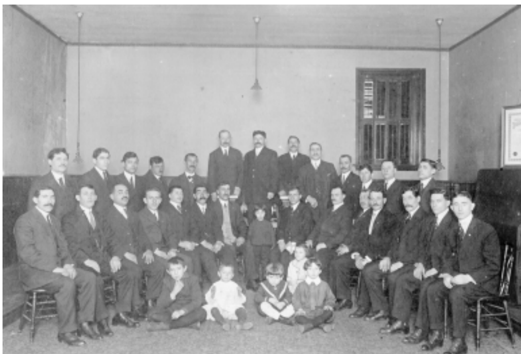
Workmans's Circle, Branch #69, 1914.