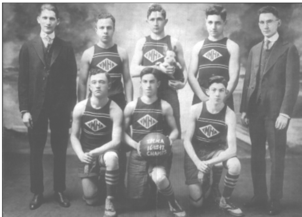
Young Men's Hebrew Association Basketball team, 1916-1917 Champs

ZIONIST ORGANIZATION OF AMERICA - WILMINGTON BRANCH