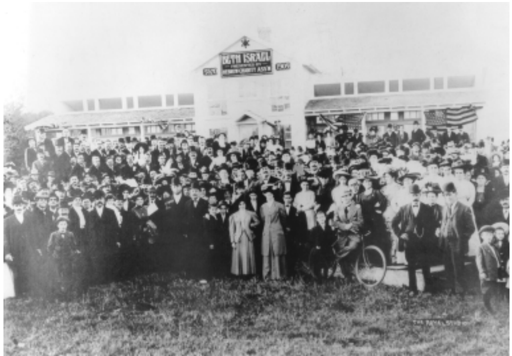
Dedication of Beth Israel, Hebrew Charity Association, 1909.

HALINA WIND PRESTON HOLOCAUST EDUCATION COMMITTEE