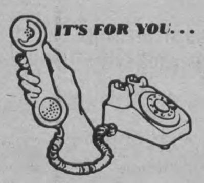
Sunday, January 27th

On Super Sunday, you will receive a call from one of your neighbors asking you to help Jews in need at home, in Israel and around the world.