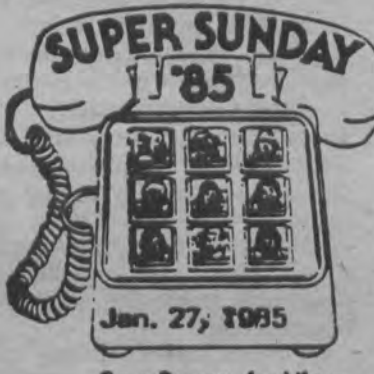
Se a Partner for Life-Answer the Call

Federation of Delaware, and active as a member of Jewish and civic activities, will present the sermon at Temple Beth Sholom in Dover on Jan. 25, 8 p.m. Her topic will be "Responding to Community