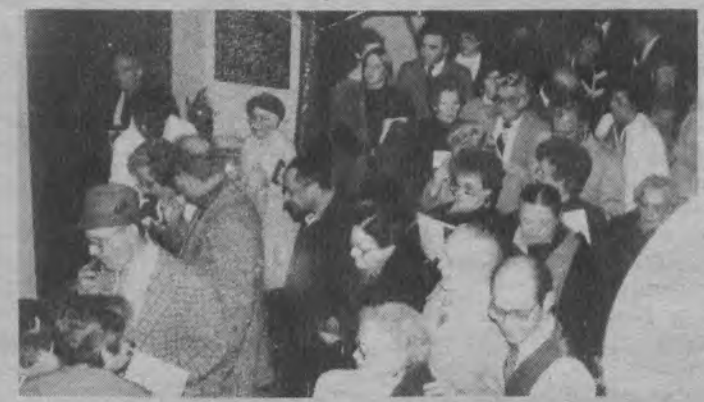
Enthusiastic turnout at the Grand Opera House for Klezmer concert.