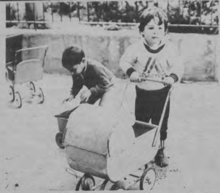
The "Be a Man - Lend a Hand" public awareness campaign has a head start at Na'amat-Pioneer Women day care centers in Israel. The campaign encourages men to share family responsibilities. (above) Day care center in