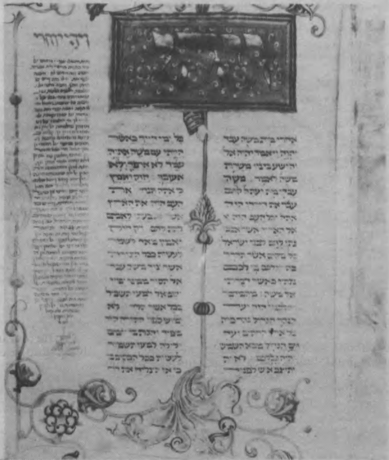
Illuminated Hebrew Bible, written in 1489 for a prominent citizen of Prague.

The most celebrated lot is a pristine and beautifully illuminated Bible ( Tanach ), written in 1489 for a prominent citizen of Prague and subsequently acquired by the noted German philosopher, Moses Mendelsohn, and later by the famous German family of Daniel Itzig in the 18th century. His heirs, numbering 15 children, are recorded on a flyleaf of the bible and were known to have married into some of the greatest