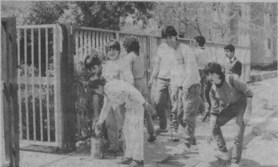
ORT student painting a fence on "Community Day"