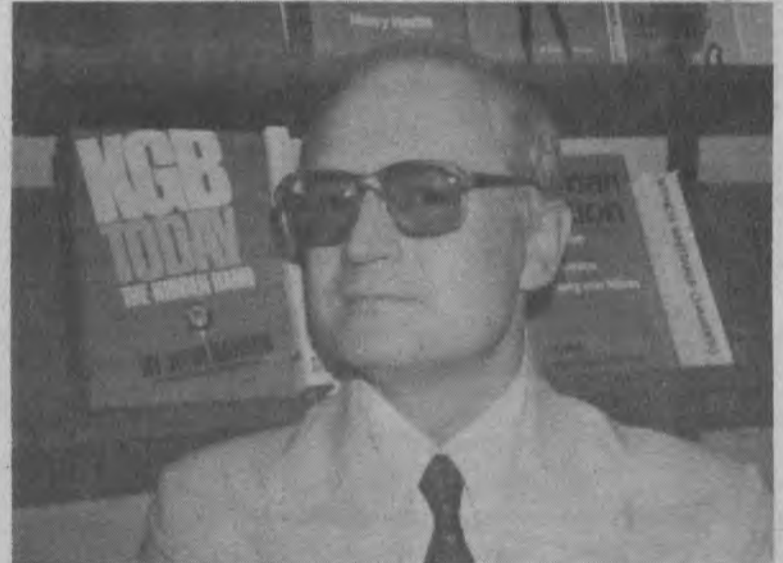
Tomas Schuman (Yuri Bezmenov)