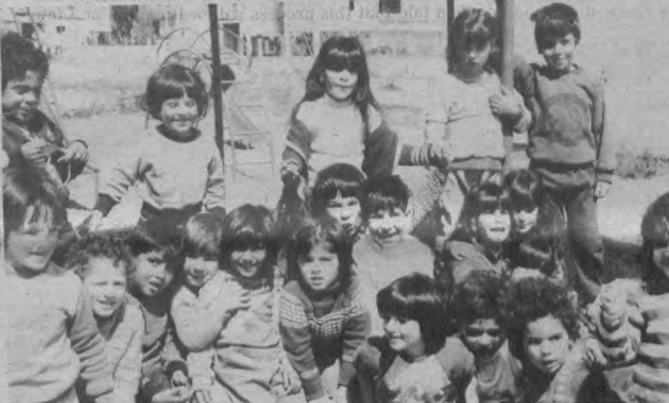
Kindergarten children in Jesse Cohen