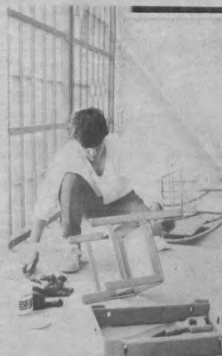
ORT student fixing chairs in the day care center on "Community Day" in Jesse Cohen

Thus Project Renewal is serving as a catalyst to prompt the people of Jesse Cohen to learn to help themselves. That's what Project Renewal is all about.