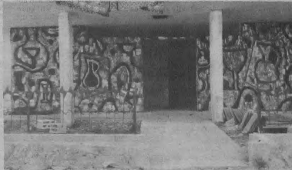
Mural painted by resident of Mesilat Olim