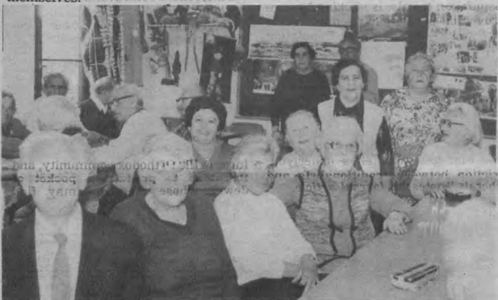
Senior Citizens Club in Jesse Cohen