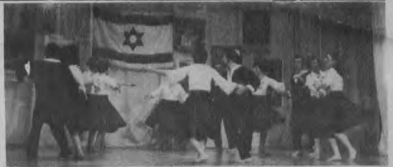
The AKSE Dance Group Cafe Tamar

In celebration of Israel's 36th year of independence, the Adas Kodesch Shel Emeth Choral and Dance groups will present an exciting program of music and dance of Cafe Tamar on Sunday evening, May 20 in the social hall of the synagogue.