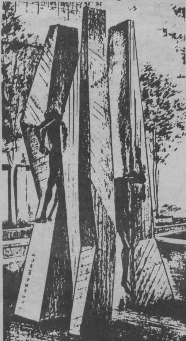
Holocaust memorial in downtown Wilmington.